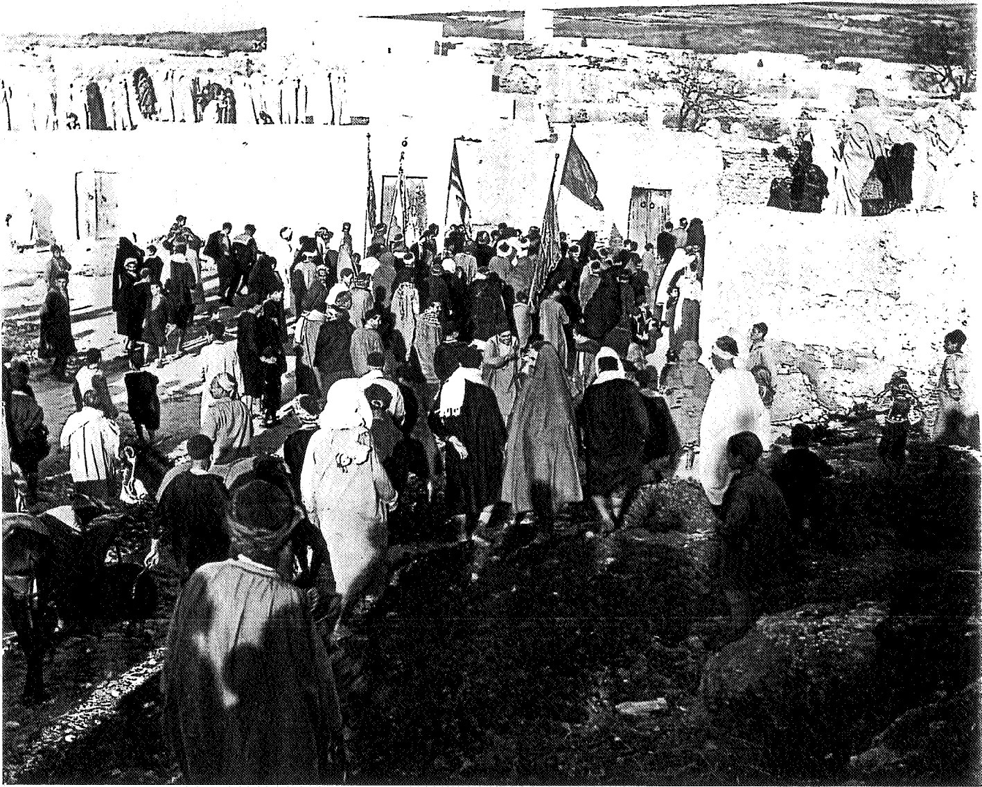
Picture 1. Procession of male pilgrims for a saint's feast, veiled women on the roofs (Soupault 1988).

ferentiation with respect to public behavior. Women before menarche and after menopause enjoy more freedom and have partial access to male-dominated spaces.