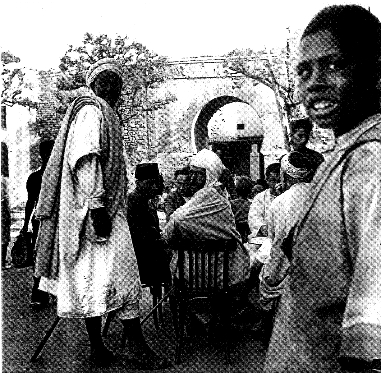
Picture 3. Popular coffeehouse in the southern part of the medina (Tunis) (Soupault 1988).