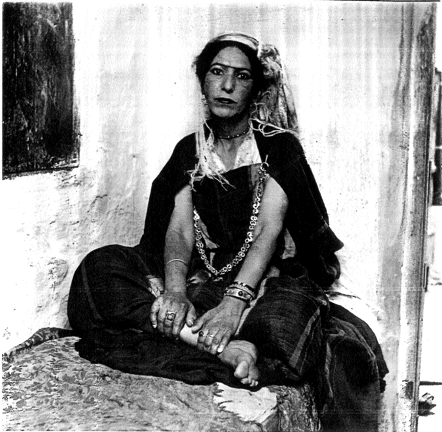
Picture 5. The Forbidden Quarter (Quartier réservé) (Soupault 1988).

actions demanded of women are prohibited to men. The dimension of gender and space in this context must be interpreted as a static structure. This polarity must remain intact in all activities. Yet there are also spaces such as the courtyards in the Old Town, which serve as “permitted spaces” and facilitate open communication between the sexes. The dynamic aspect of this model with respect to time must be seen in a different light, however. Actions prohibited to young men and women are demanded of older men and women, and vice versa. The model shows that the spatial polarization between men and women is created mainly during the reproductive phase in each individual’s generative cycle. In a simplified manner of speaking, there is a principle of mutual exclusion in the