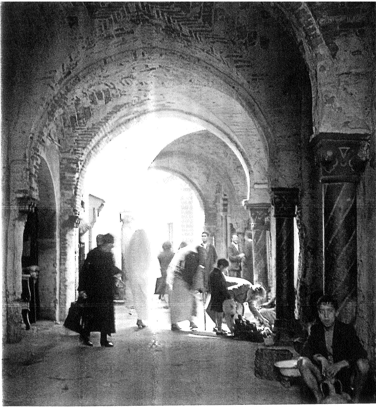
Picture 4. The Sug Blat (herb and spice market) in the medina of Tunis (Soupault 1988).