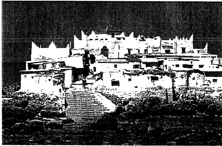
Figure 2: The entrance to the Island of Sidi °Abderrahman at ebb tide.