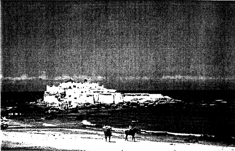
Figure 1: The Island of Sidi °Abderrahman south of Casablanca, at the beach of Ain Diab. The status of the Island is secured by public authorities.